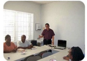
A Facilitators Training Course was conducted for Kairos graduates of Trinidad and Tobago, and Barbados