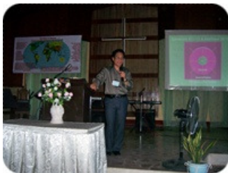
. . . and giving keynote address at the Missions Festival in Urdueta City