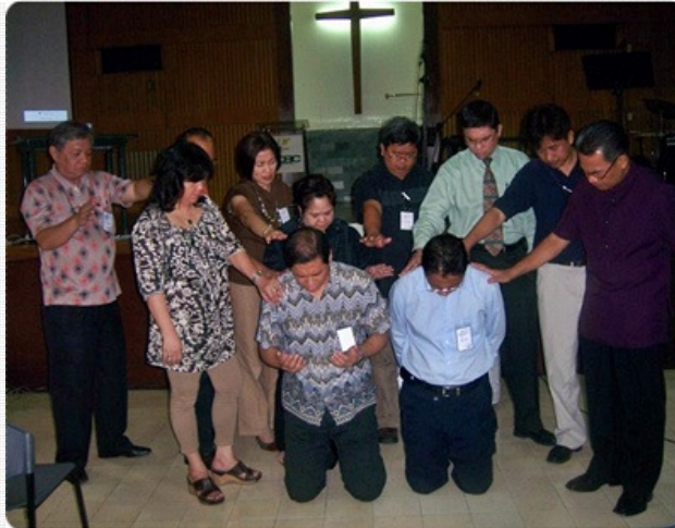
A sweeping sense of reverence awed every person in the house as the two leaders knelt and were prayed for by the PMA Board of Directors.

The Philippine Missions Association 26th General Assembly was held at Capitol City Baptist Church, last February 23 and 24. The ministries and resources of PMA and its members were presented. Action International Ministries Philippines Inc., North Hills Village Missions Inc., Carrascal Gospel Church Ministries Int'l., Philippine Campus Crusade for Christ (PCCC), New Tribes Mission of the Philippines, Joong Ang Presbyterian Church, OMF Philippines Inc., and Translators Association of the Philippines (TAP) presented their ministries while Operation Mobilization (OM) Philippines, Cross Train, Asian Center of Missions (ACM), ASDECS, and World in Need, Philippines presented their resources and training programs.