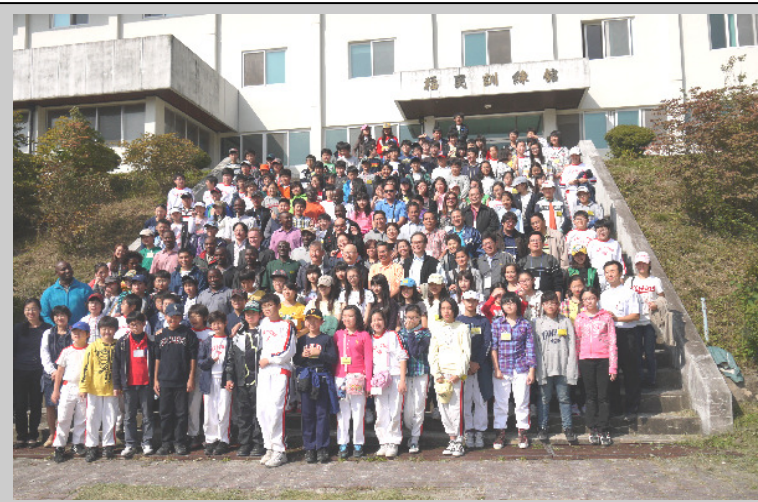
Group photo of CFS trainees. Countries represented are Korea, Uganda and the Philippines