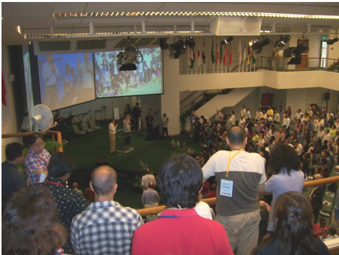
Participants at the 4/14 Global Summit

The first 4/14 Global Summit Conference was held in New York, USA. A fourth 4/14 Global Summit Conference is scheduled to be held in Brazil in 2013.